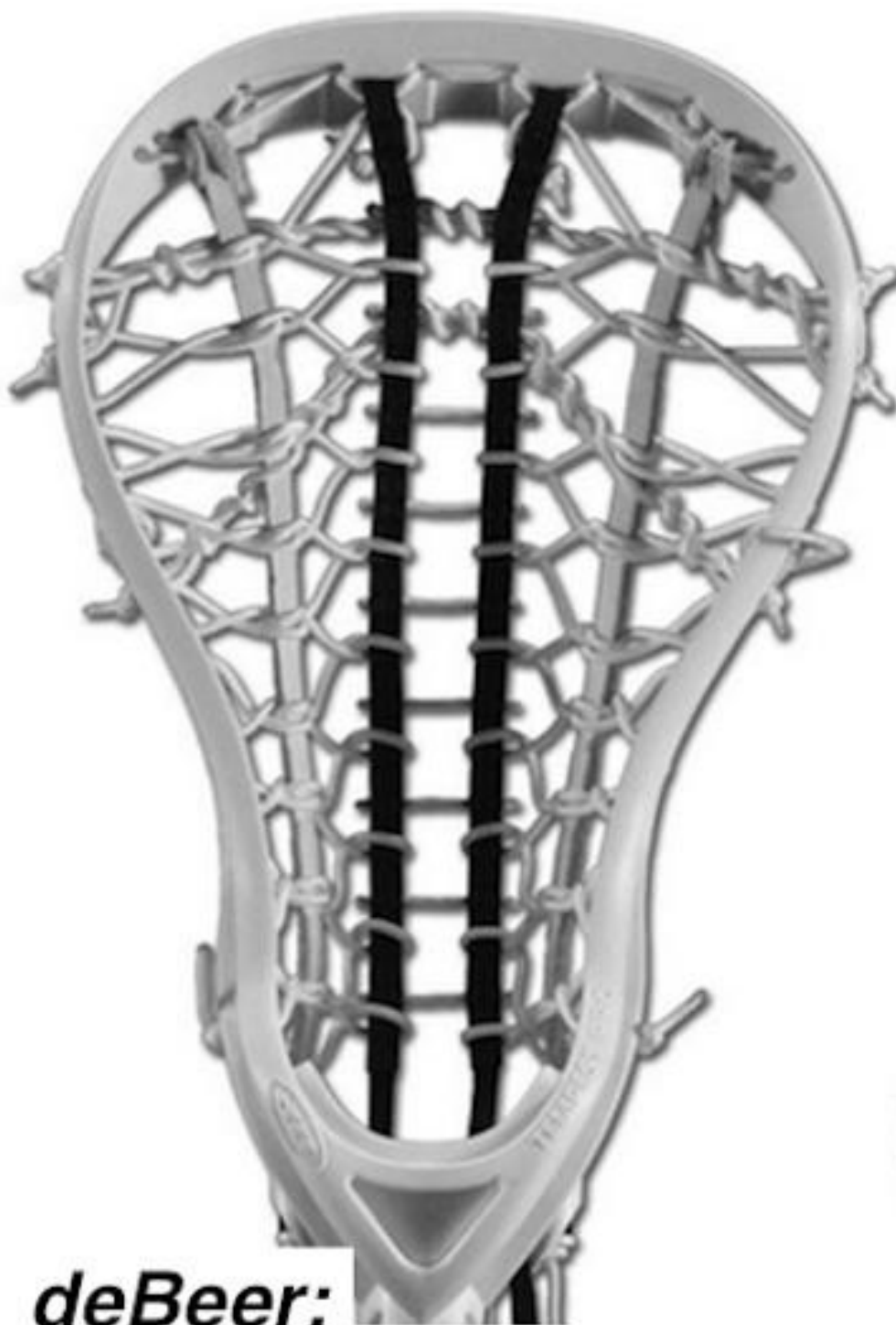
deBeer: GripperPro Pocket