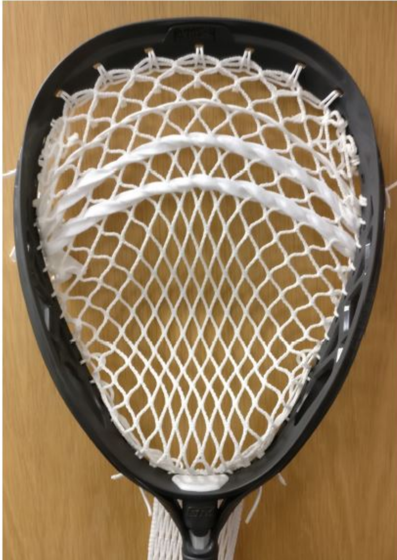
STX Eclipse II