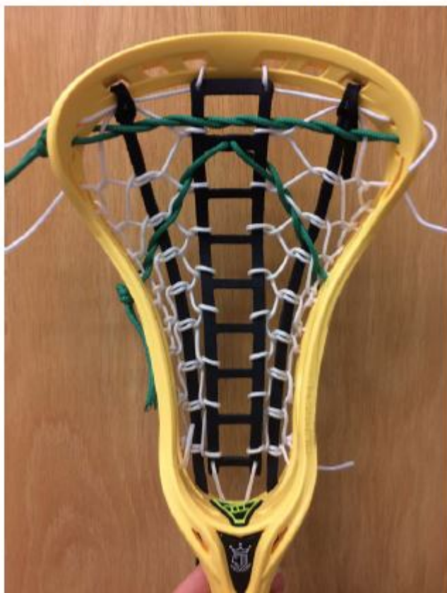
Figure 1: Brine MOD pocket front view