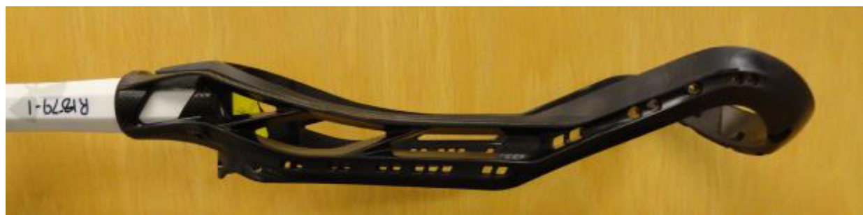
Side View unstrung Spotlight