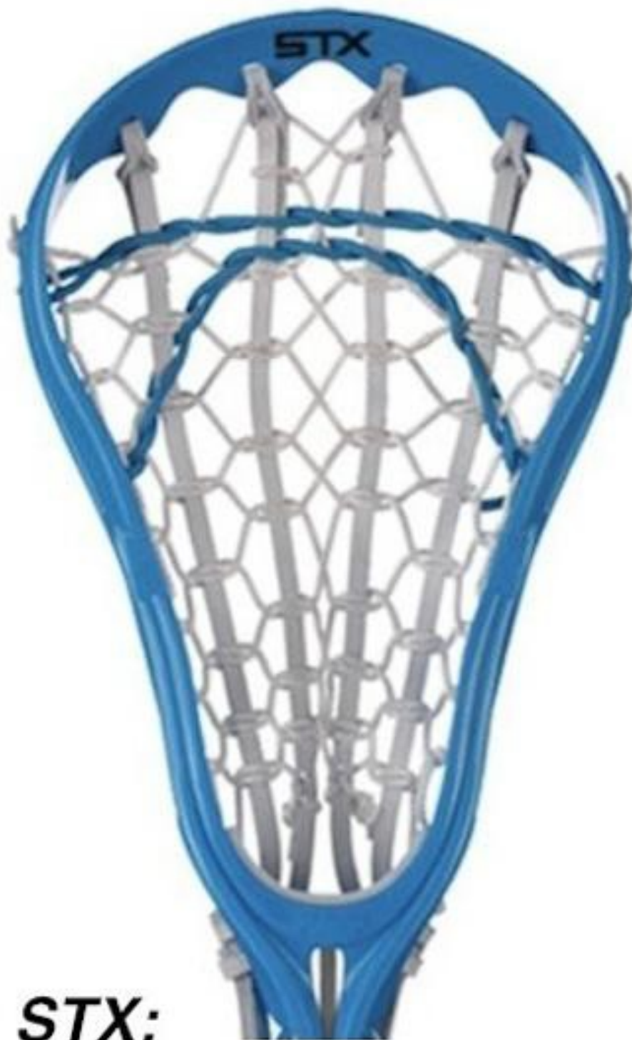
STX: Channel V Pocket