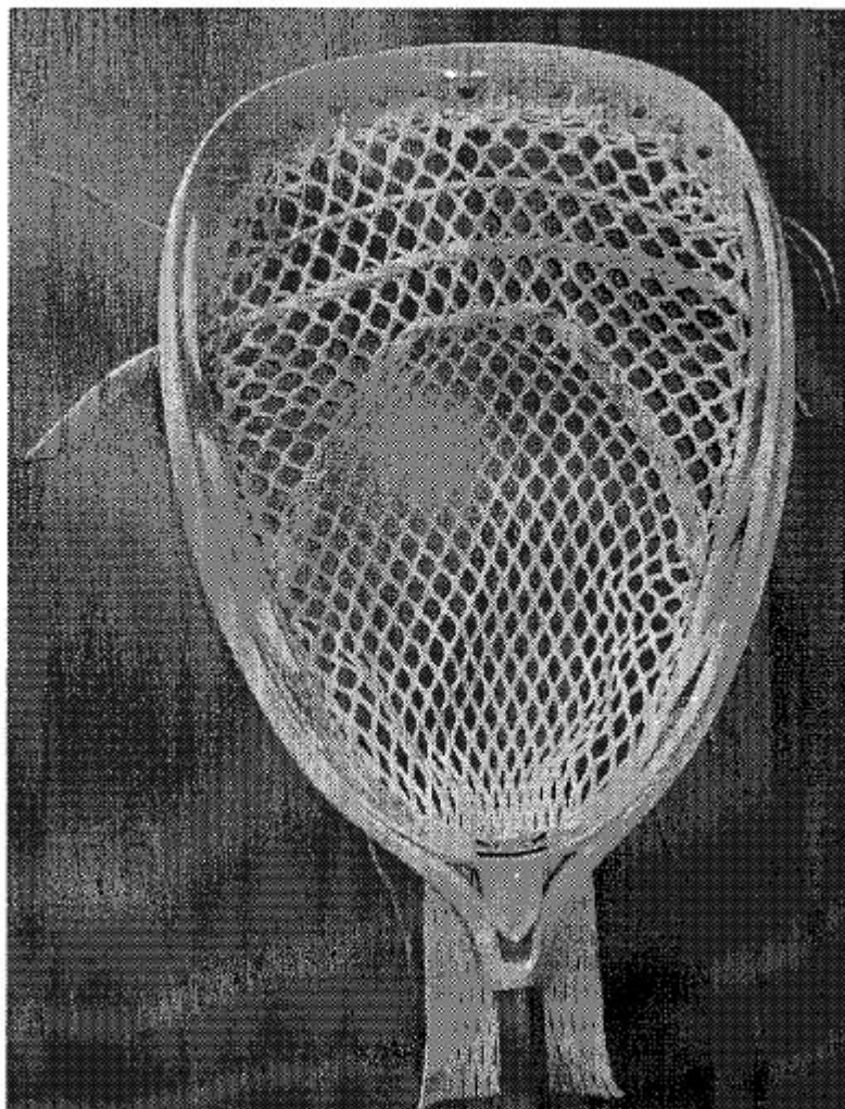
Figure 1: Brine Eraser II goalie head.