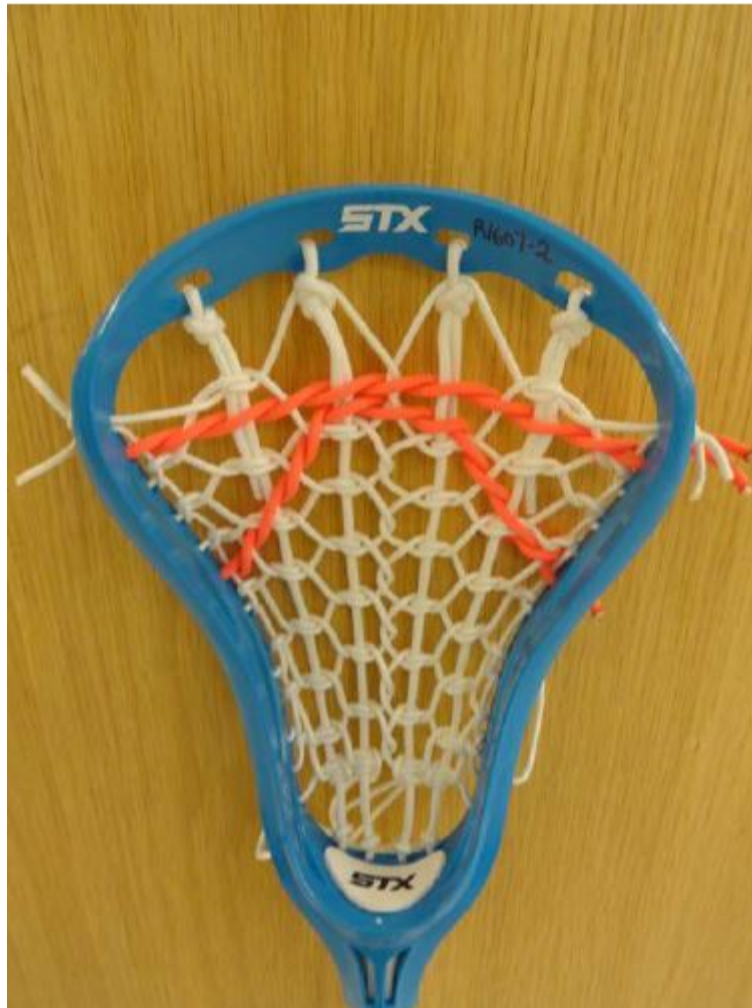
Figure 1. STX Exam 200 head from